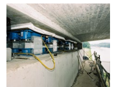
Maas Waalkanaal (NL)