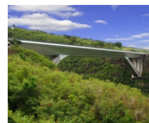
La Réunion (FR)