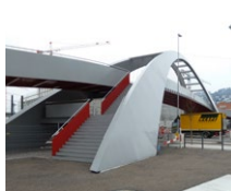
Gleisbogen Bridge (CH)