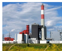
Thaiss Power Plant (AT)