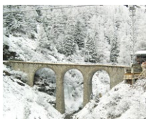
Val da Pila (CH)