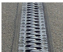
Cantilever finger joints