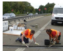
Kasseler Kreuz (DE)