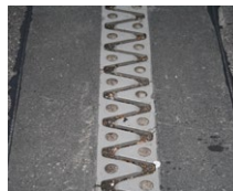
Hang Bridge (DE)