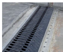
Sliding finger joints