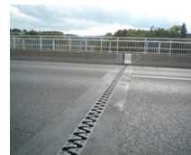
Fürstenland Viaduct (CH)