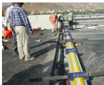
Fanja Bridge (Oman)