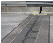
Brüttiseller Kreuz (CH)